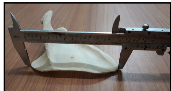
Fig-2: Scapular length measurement by Vernier caliper.

Measurements were taken in millimetre with the help of Vernier calliper (with precision 0.02 mm), osteometric board, white paper, lead pencil. We took measurement of each data three times by two observers and finally took the mean value of each data to avoid observational bias (Fig 2- 5).